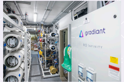
RO Infinity at a US project site for a Fortune 500 industrial client.