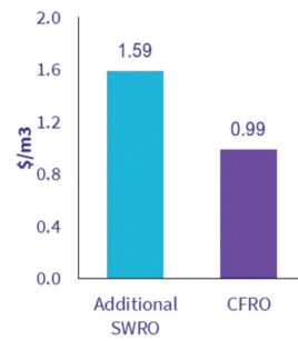
Figure 1: Cost to Expand Fresh Water Production for SWRO desalination